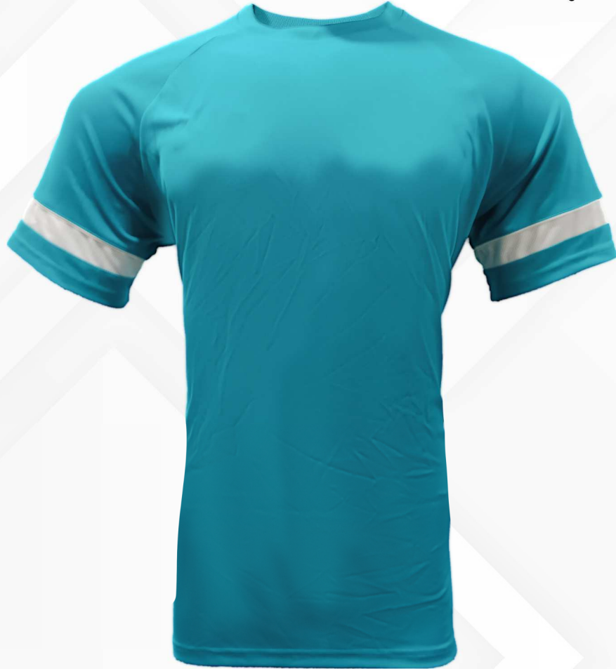
T-Shirt 5 ZT-60