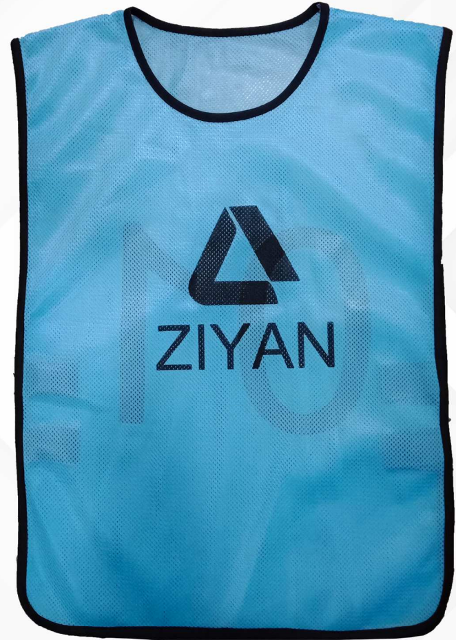
Vest 6 ZT-06