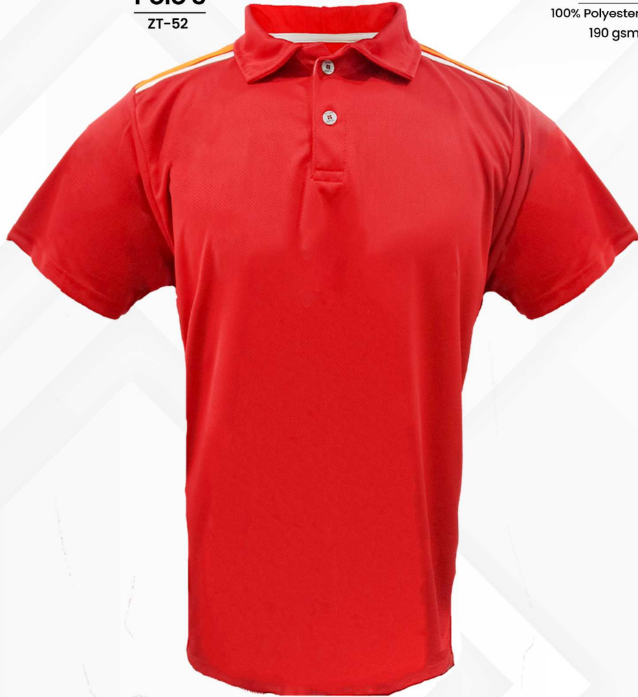
Polo 3 ZT-52