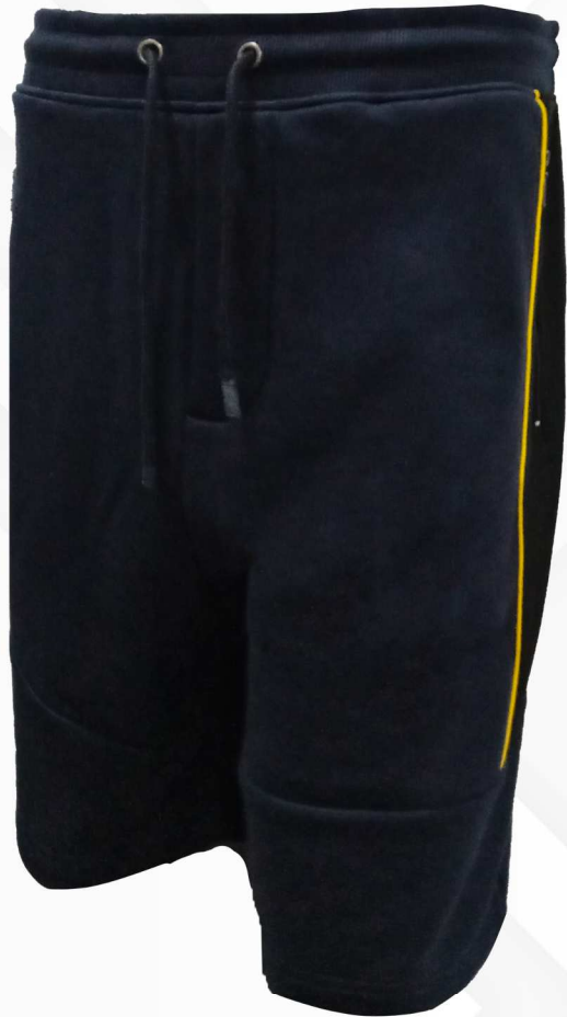
Short 1 ZT-38