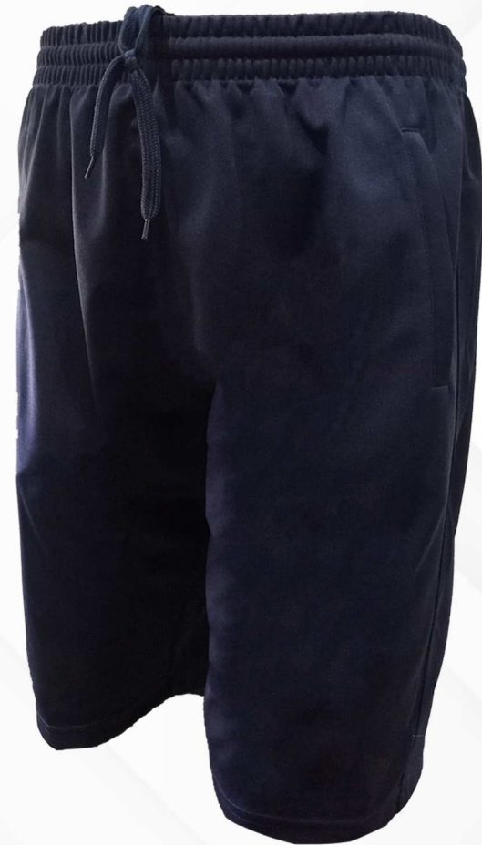
Short 2 ZT-39