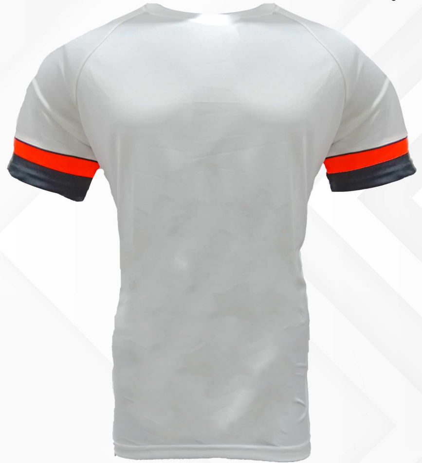
T-Shirt 6 ZT-61