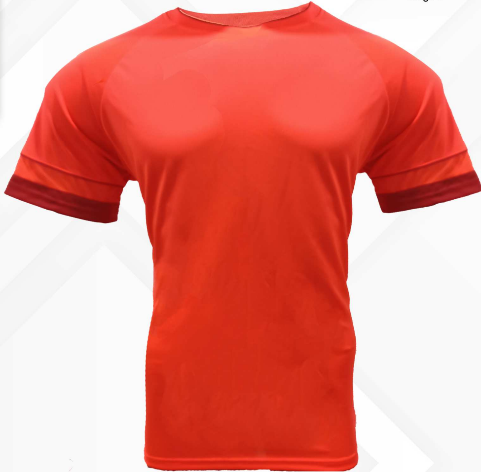
T-Shirt 3 ZT-58