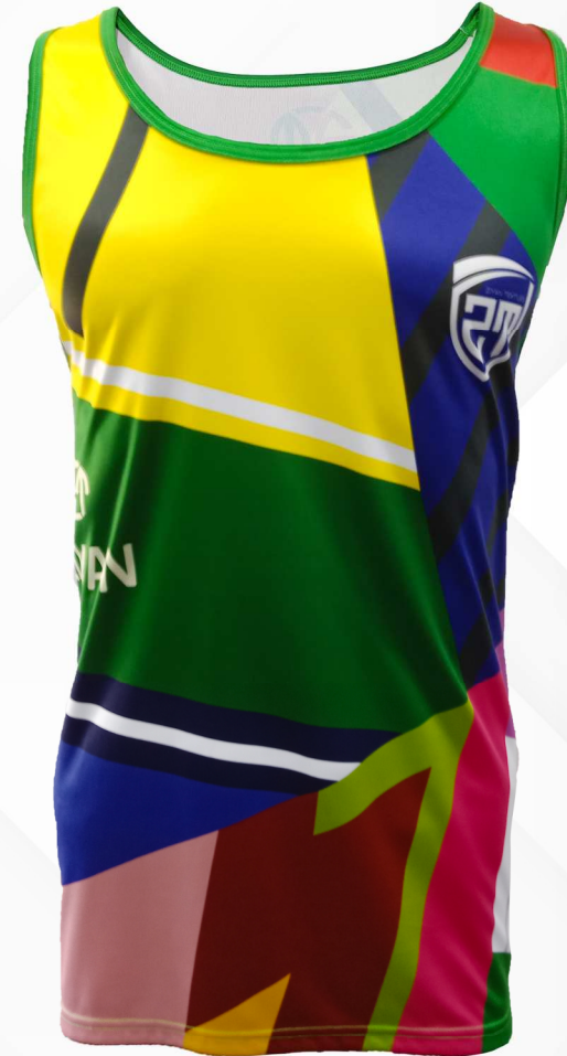
Singlet 6 ZT-81