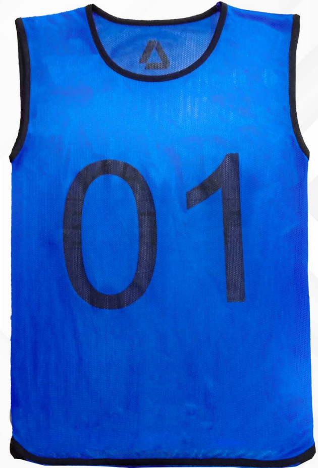
Vest 2 ZT-02