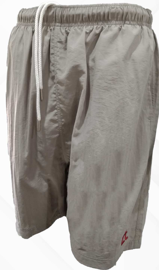
Short 4 ZT-41