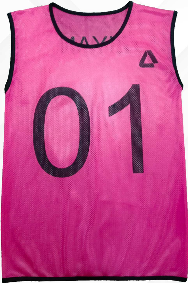
Vest 5 ZT-05