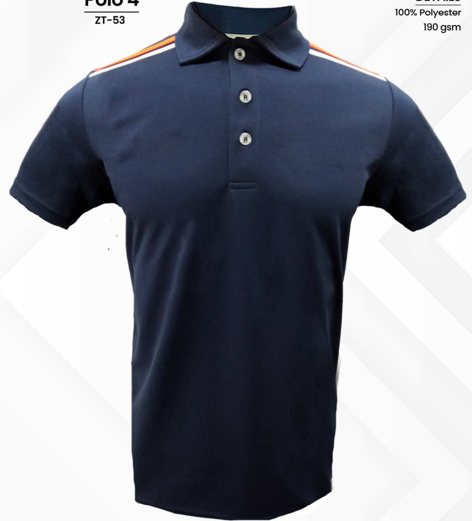
Polo 4 ZT-53