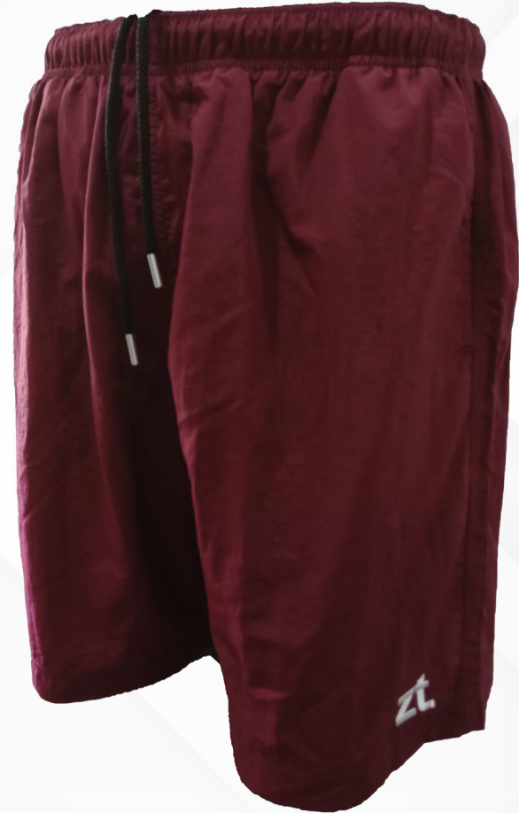
Short 6 ZT-43