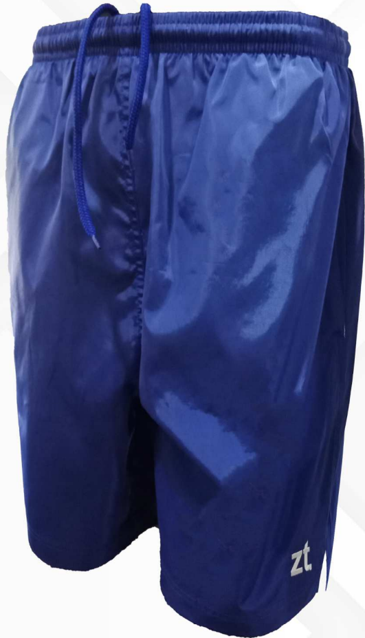
Short 3 ZT-40