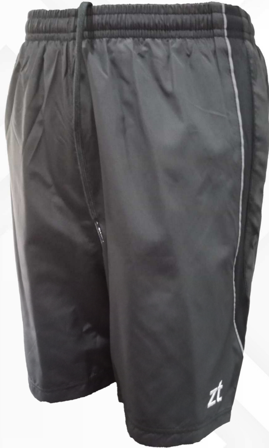
Short 5 ZT-42