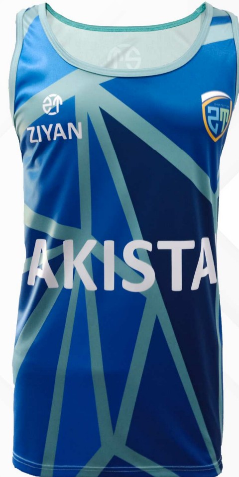
Singlet 4 ZT-79