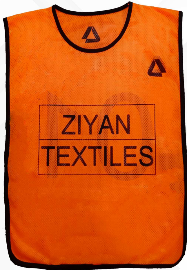
Vest 3 ZT-03