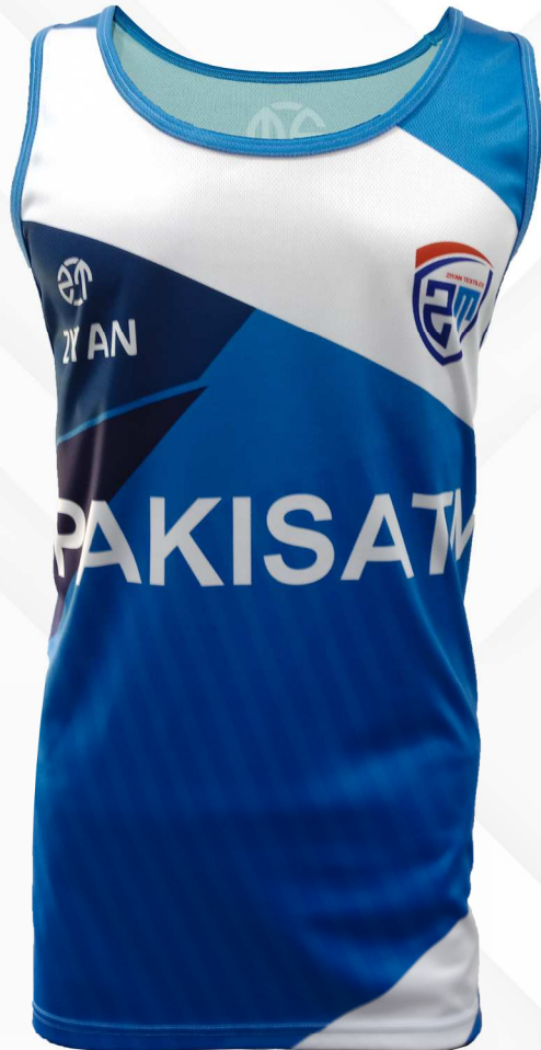
Singlet 5 ZT-80