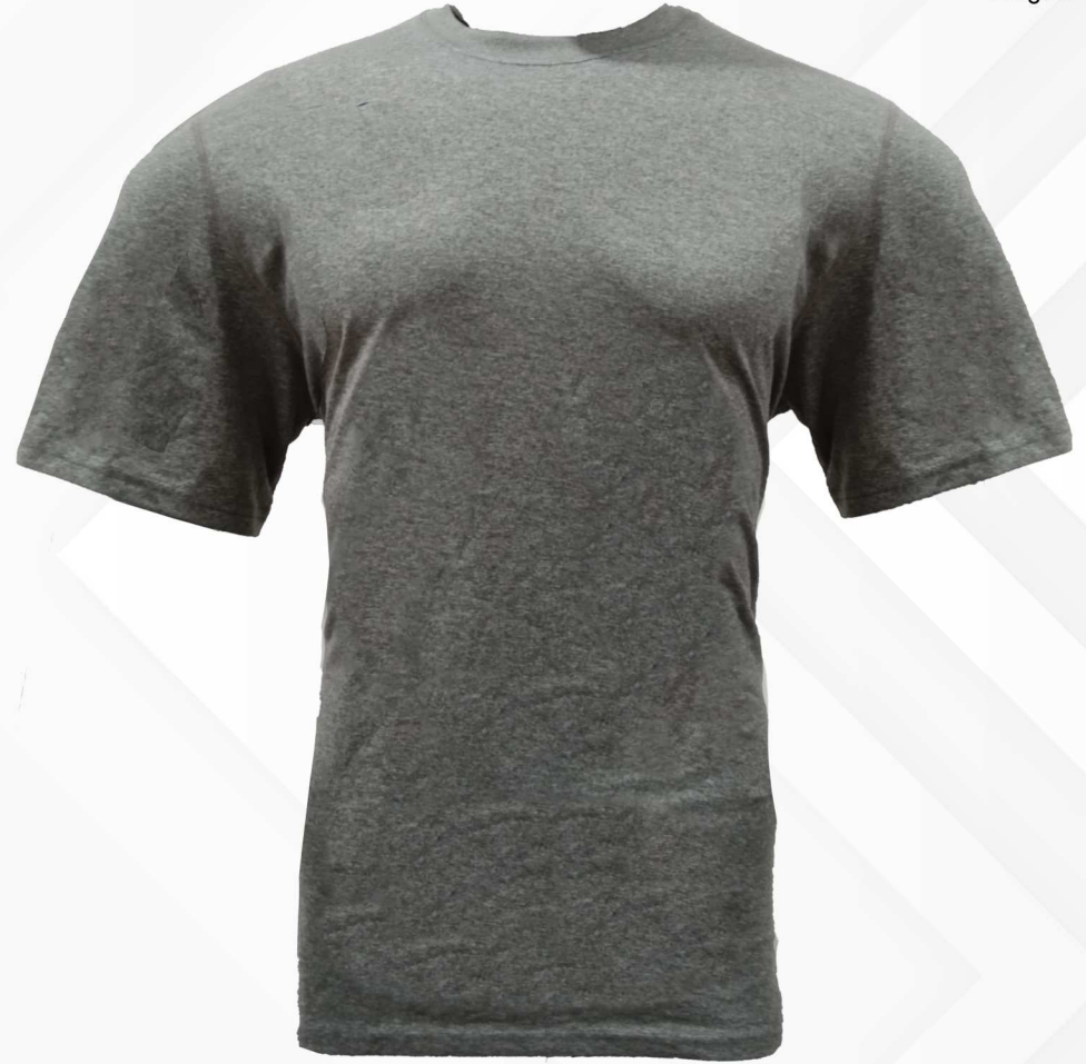
T-Shirt 4 ZT-59