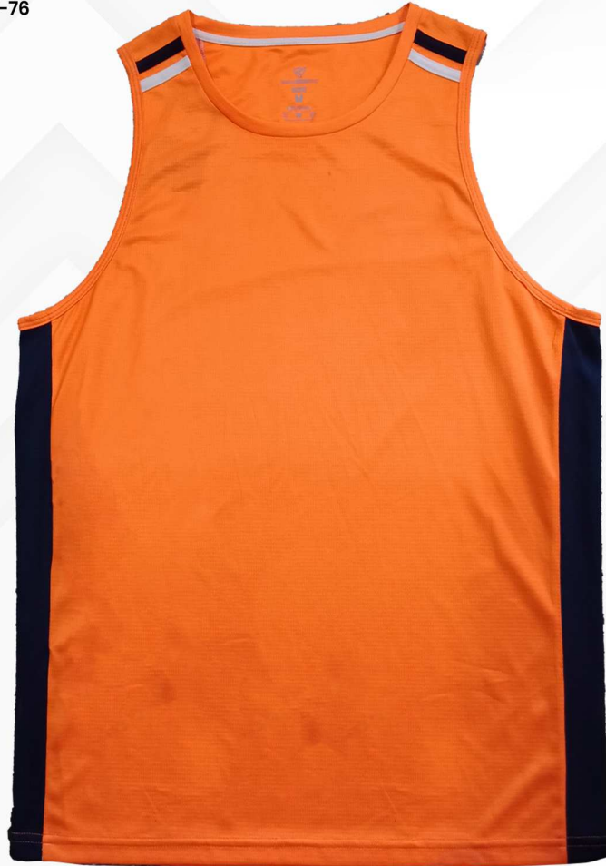
Singlet 1 ZT-76