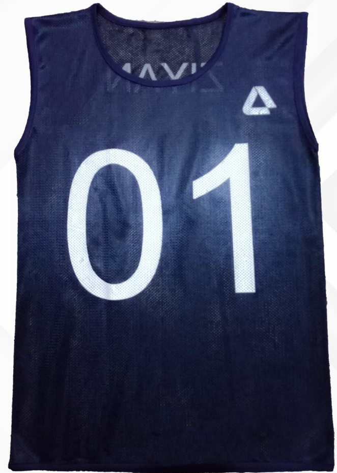
DETAILS 100% Polyester 95 gsm