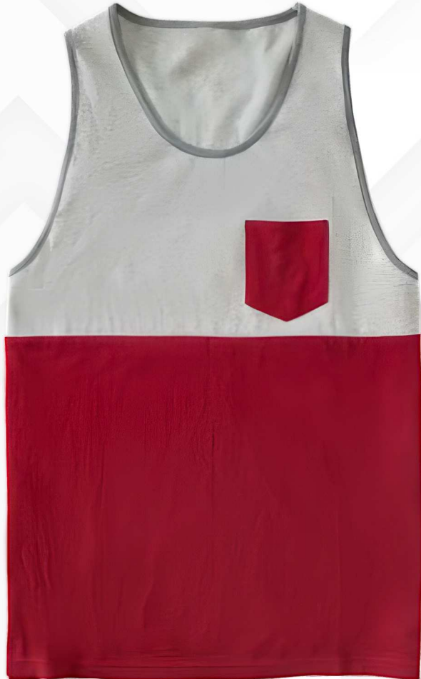
Singlet 3 ZT-78