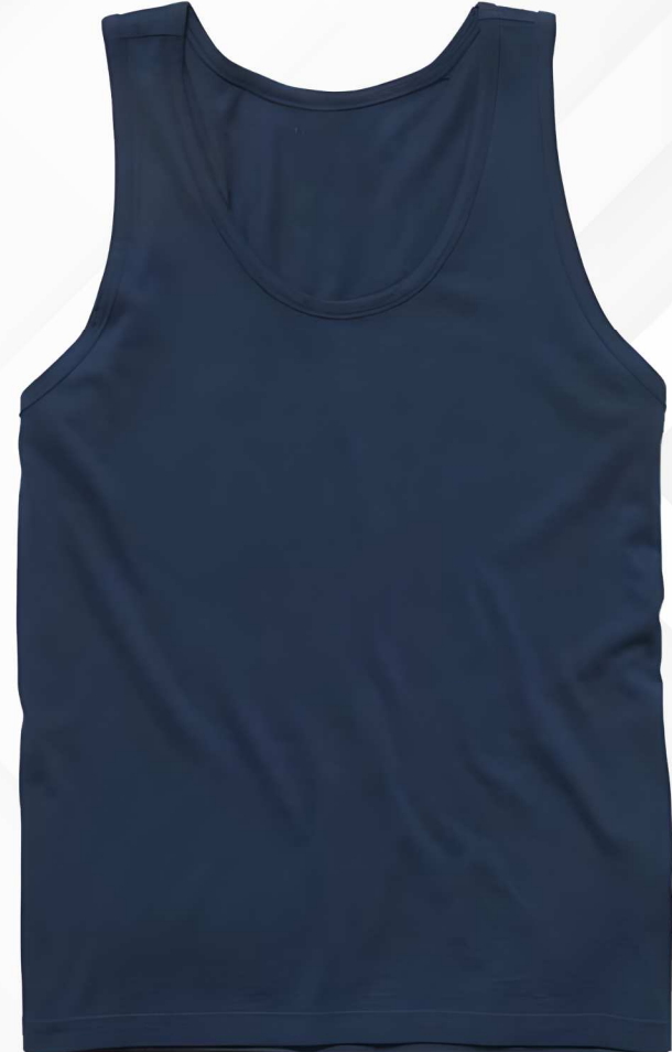
Singlet 2 ZT-77