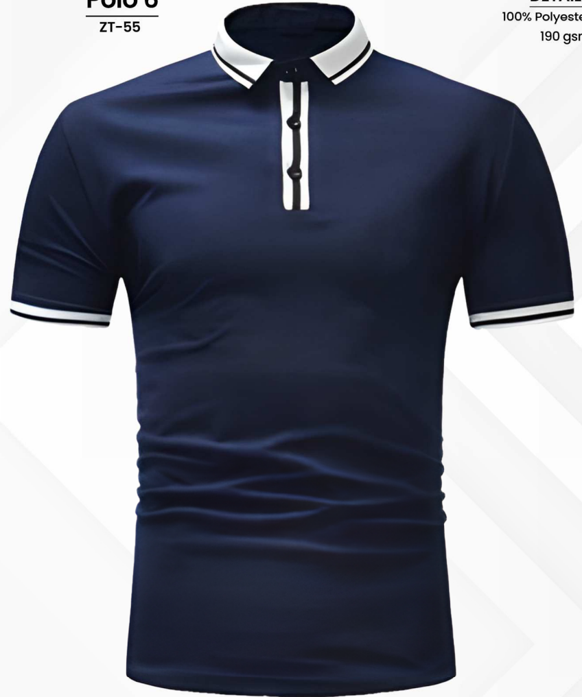
Polo 6 ZT-55