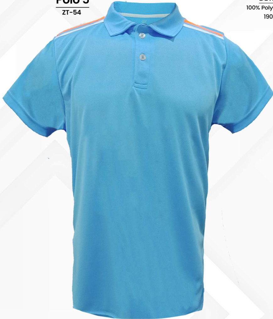
Polo 5 ZT-54