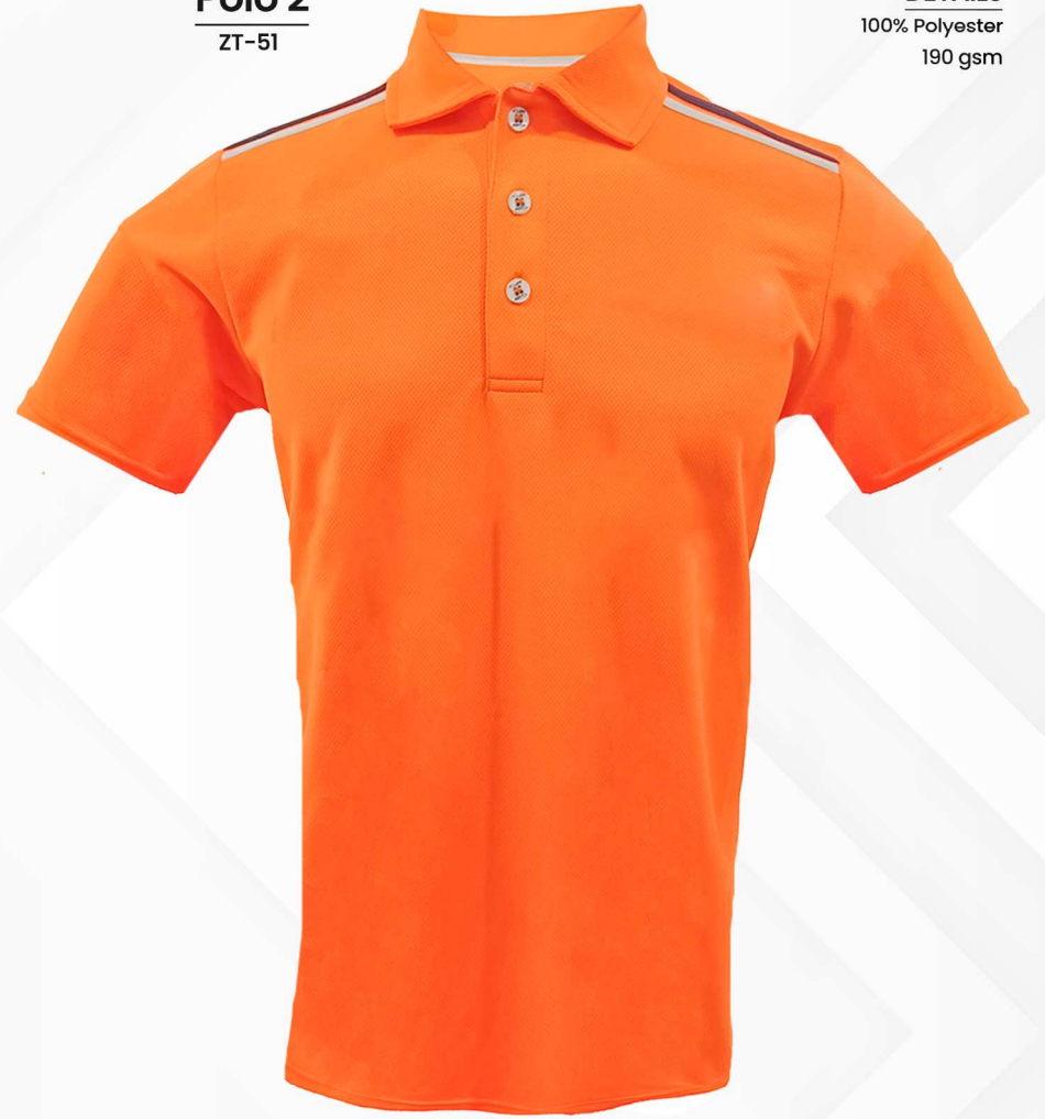
Polo 2 ZT-51